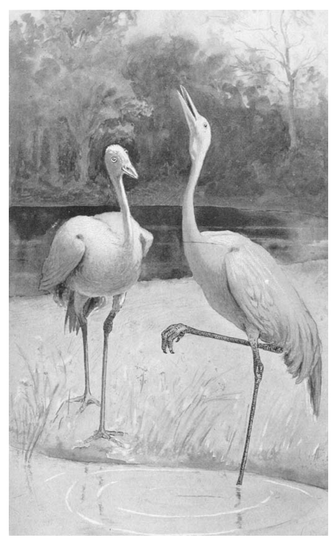
"WHAT FINE BIG MOUTHFULS YOU CAN TAKE!"