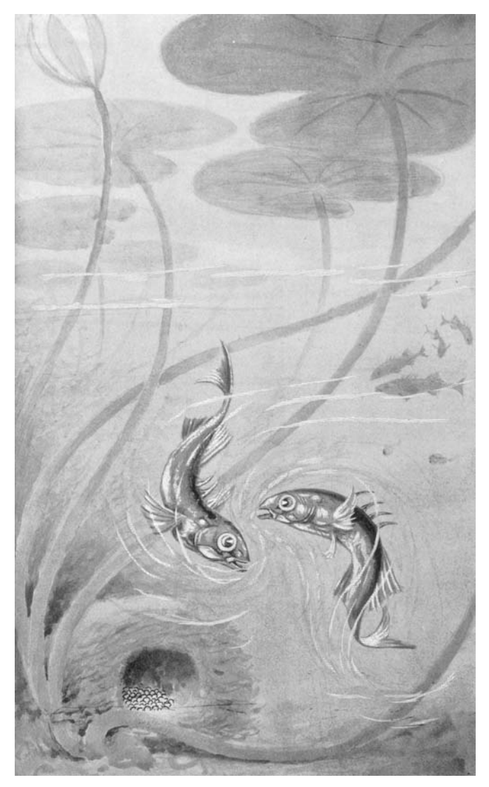
THEN THEY SWAM AT EACH OTHER.