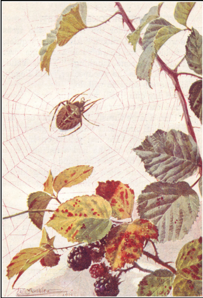
A GARDEN SPIDER AND BLACKBERRY BRANCH