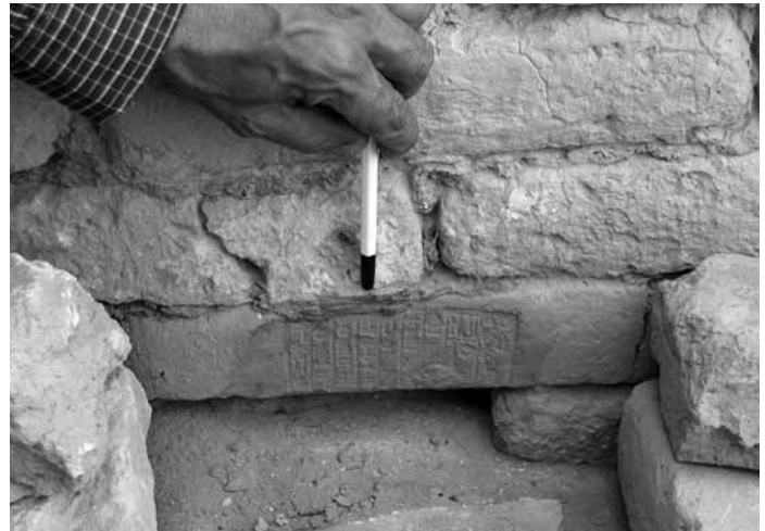
Ancient cuneiform writing in Ur, southern Iraq.

They wrote on clay tablets with long reeds while the clay was still wet. The fresh clay hardened and a permanent record was created. The original Mesopotamian writings were crude pictures of the objects being named, but the difficulty of drawing on fresh clay eventually produced the wedges and hooks unique to cuneiform. This writing would be formed by laying the length of the reed along the wet clay and moving the end nearest the hand from one side to another to form the hooks. As with all cultures, writing greatly changed Mesopotamian social structure and the civilization's relationship to its own history. Writing allowed laws to be written (e.g., Hammurabi Code) and so to assume a static and independent character. Also, history became more detailed and incorporated much more of local cultures' histories (Richard Hooker).