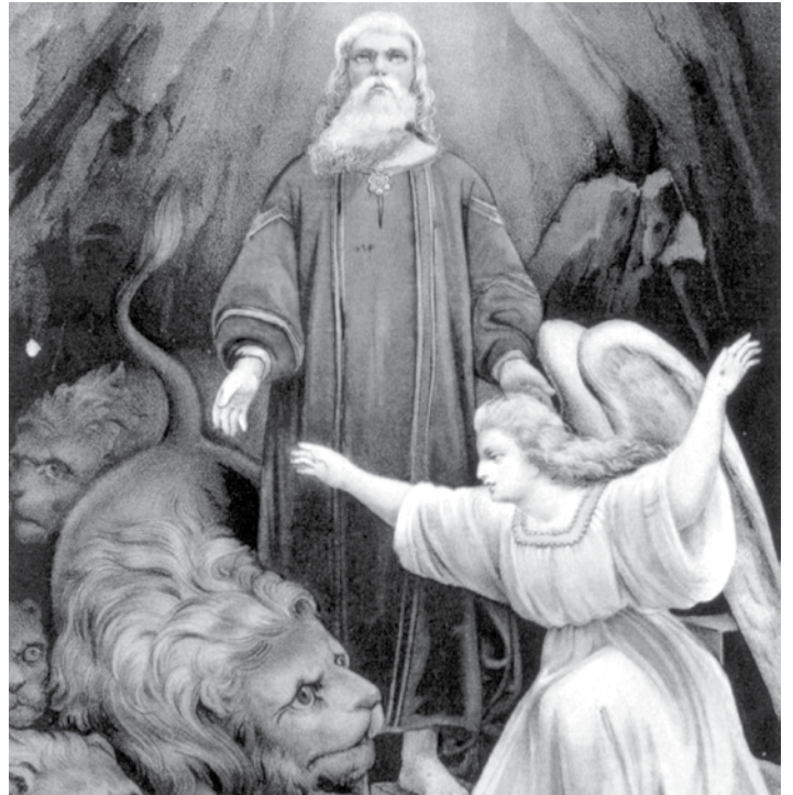
Daniel in the Lions' Den by Currier & Ives, c1893.

Daniel is one of those pivotal men of history who was able to make a great impact on history without having any official influence or power. One of the four great prophets, although he is not once spoken of in the Old Testament as a prophet, Daniel was born in Jerusalem about 623 BC during the reign of Josiah. At the first deportation of the Jews by Nebuchadnezzar (the kingdom of Israel had come to an end nearly a century before), Daniel and other noble youths were carried off to Babylon. As was the custom, the young elite of a conquered nation were taken to the mother country where they were raised in the ways of the empire. The hope was that the Jewish exiles would become good Babylonian citizens. Daniel was obliged to enter into the service of the king of Babylon, and in accordance with the custom of the age received the Chaldean name of Belteshazzar. His training in the schools of the wise men in Babylon was to fit him for service to the empire. Daniel, however, while he was willing to serve his new masters in an official capacity, had no intention of embracing Babylonian religion or culture. In fact, Daniel was distinguished during this period for his piety and his strict observance of the Mosaic Law. He gained the confidence and esteem of those who were over him. In other words, he was willing to prosper in Babylon, but he would never be a Babylonian. His habit of attention gained during his education in Jerusalem enabled him to soon master the wisdom and learning