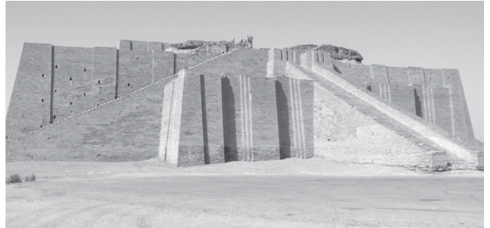
The reconstructed facade of the Neo-Sumerian Great Ziggurat of Ur, near Nasiriyah, Iraq, by Hardnfast, 2005.

German late medieval depiction of the construction of the tower, by Meister der Weltenchronik, c1370s.