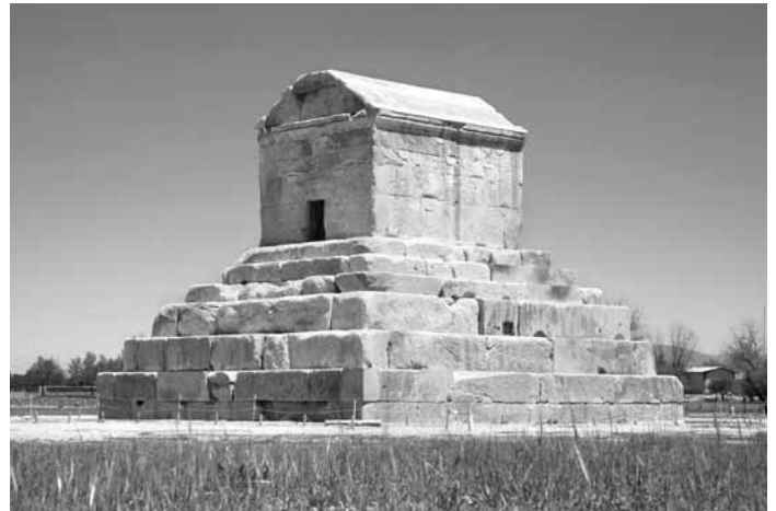
The tomb of Cyrus the Great in Pasargad, Iran.

Other contiguous people groups took note of these wonderful things. They were not slow to follow. About 2330 BC, Sumeria was conquered by Sargon I, king of the Akkadians. The Gutians, tribespeople from the eastern hills, ended Akkadian rule about 2200 BC, and, a few years later,