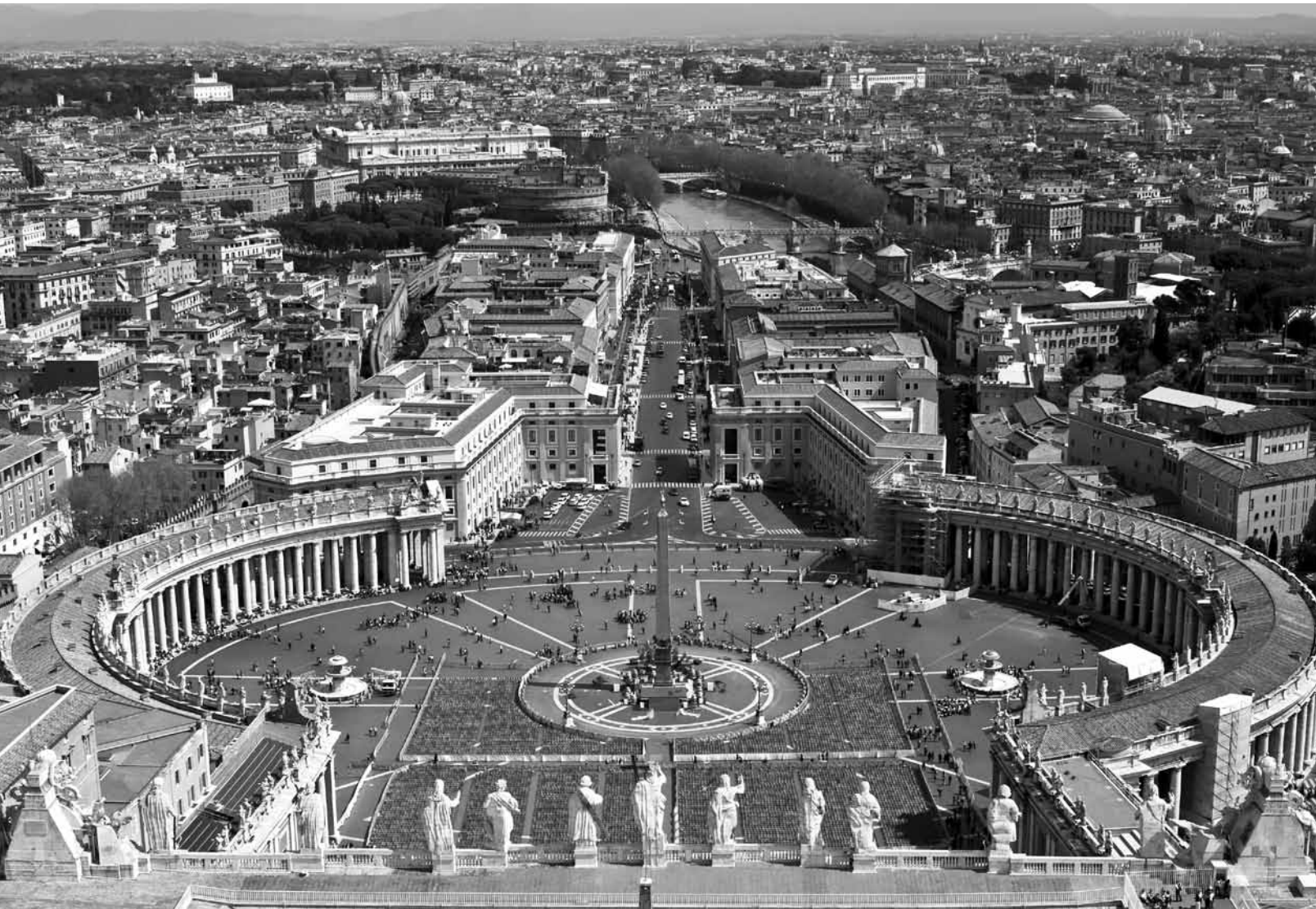
View from the top of St. Peters Basilica in the Vatican city. Large parts of central Rome are visible.