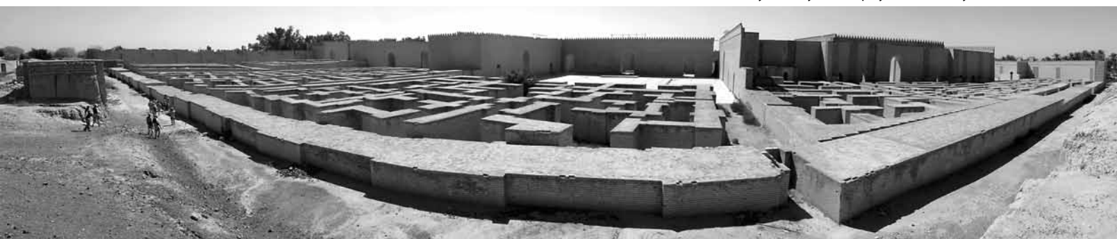
View over the reconstructed city of Babylon, Iraq, by the U.S. Navy, 2005.

Discuss at least three important contributions that the Sumerian civilization made to the Western world.