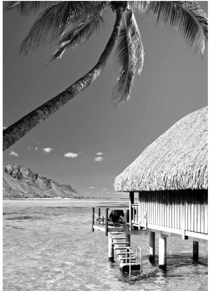
Bungalow in Bora Bora

This happened in my own life. 150 years ago my great-great-grandfather, whose passion was to kill Yankees, was a slave owner in Eastern Tennessee. With that inheritance, like most white Southerners who grew up in the