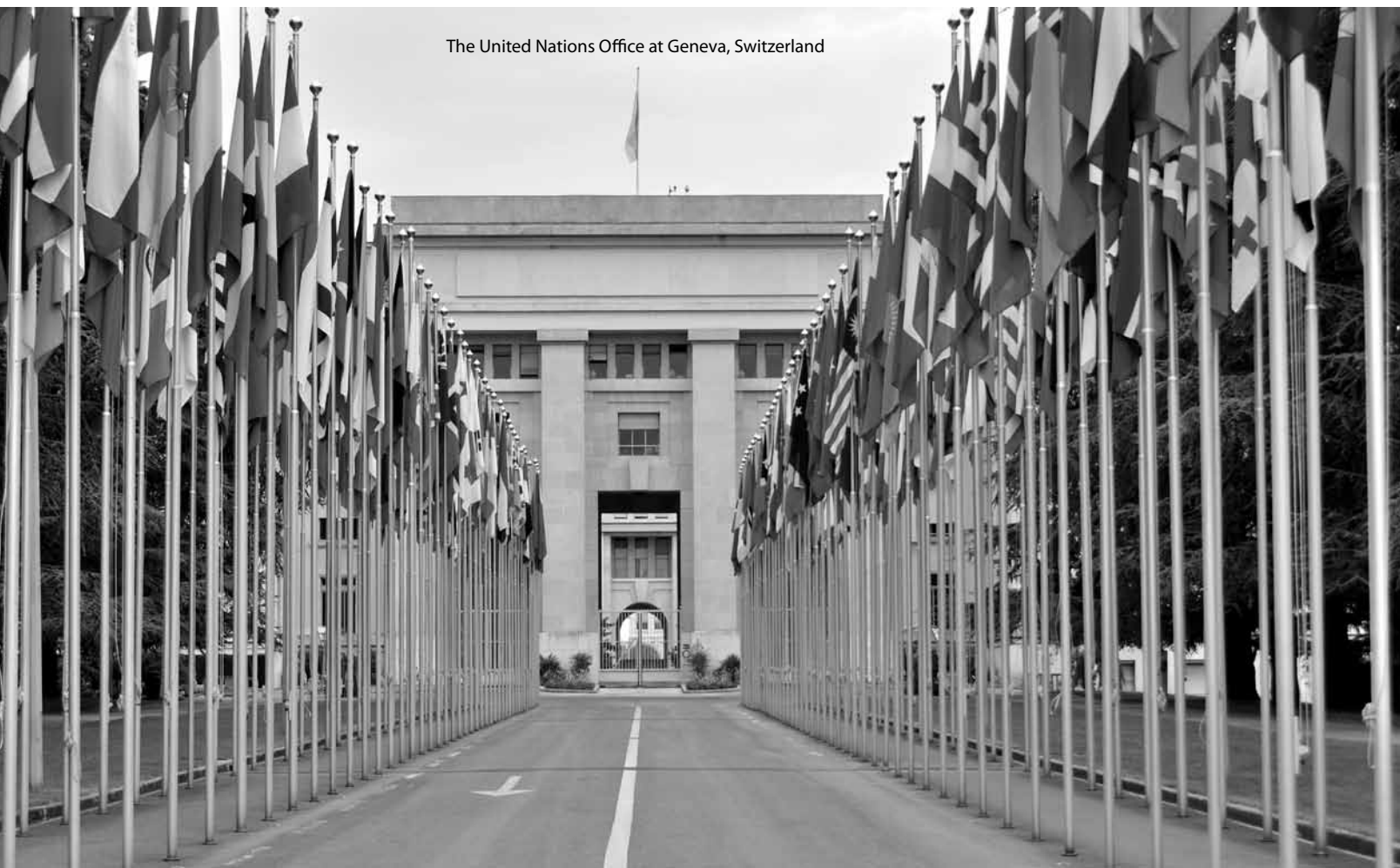
The United Nations Office at Geneva, Switzerland

To be a true history, an account of the past must not only retell what happened but must also relate events and people to each other. It must inquire into causes and effects. It must