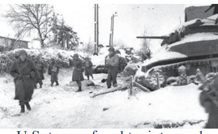
U.S. troops fought winter and the Axis Powers at the Battle of the Bulge.

weak point in the American position. <sup>19</sup>A bend in the U.S. frontlines was created that was 80 miles long and 50 miles wide. <sup>20</sup>The so-called "Battle of the Bulge"