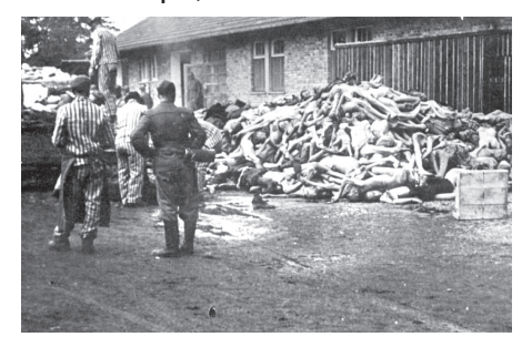
Allied troops and surviving prisoners view a pile of bodies at a Nazi death camp.

overwhelming: the Axis Powers had systematically killed more than six million Jews and several million more gypsies, communists, Polish Catholics, and others deemed