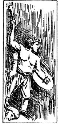
A BARBARIAN ALLY OF THE ROMANS

choosing some man as leader and following him wherever he led; but the moment that he showed himself a poor commander or failed to give them a fair share of whatever spoils they had captured, they left him and sought another chief. When the time had come that the Romans were no longer willing to defend themselves, it seemed to them a most comfortable arrangement to send a messenger to some of the Teuton chiefs to say, "If you will help us in this war, we will give you so much gold." Unluckily for themselves, the Romans looked upon barbarians as nothing more than convenient weapons, and did not stop to think that they were men who kept their eyes open, and who sooner or later would be sure to feel that there was no reason why they, as well as the Romans, should not take what they wanted if they could get it.