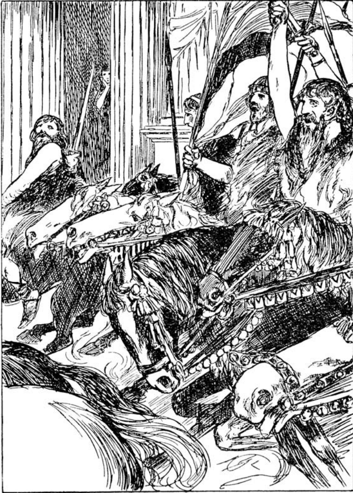
A BARBARIAN INVASION