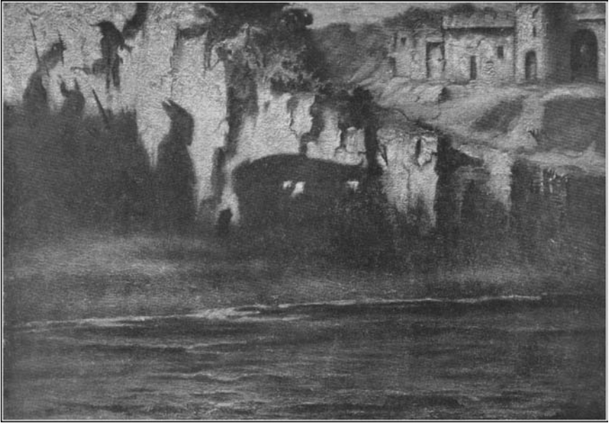
BRINGING BACK THE BODY OF SIEGFRIED

years. At the end of that time she asked him to invite the king and court of Burgundy to visit them. The Burgundians accepted the invitation, though the murderer Hagen urged them to remain at home. In