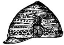
BRONZE HELMET OF A FRANKISH WARRIOR

O F all the Teutons who came to live on Roman territory, the most important were the Franks, or free men. They had no wish to wander over the world when they had once found a country that pleased them, and so, since they liked the land about the mouth of the Rhine, they settled there and held on to it, adding more and more wherever a little fighting would win it for them. Each tribe had its chief; but Clovis, one of these chiefs, came at last to rule them all. The country west of the Rhine, then called Gaul, was still partly held by the Romans, but Clovis meant to drive them away and keep the land for the Franks. When he was only twenty-one, he led his men against the Roman governor at Soissons and took the place. From here he sent out expeditions to conquer one bit of land after another and to bring back rich booty. The most valuable treasures were usually kept in the churches, and the heathen Franks took great