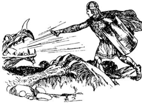
SIEGFRIED FIGHTING THE DRAGON

about him, and he had entirely forgotten that he had ever ridden through the ring of fire or seen Brunhild before. The hand of the king's sister, the gentle, lovely Kriemhild, was to be his reward for his service to King Günther; and now both weddings were celebrated. Günther and Brunhild remained in Burgundy, and Siegfried carried Kriemhild to his kingdom in the Jutland.