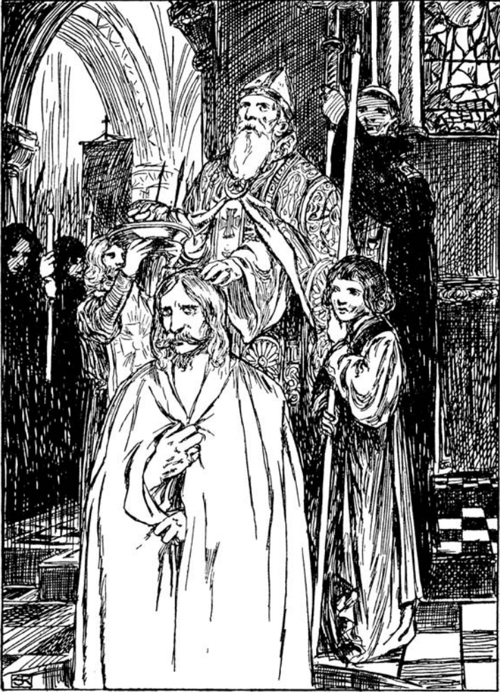
BAPTISM OF CLOVIS