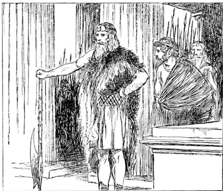
ALARIC AT ATHENS

found themselves between two fires, for another people, the Huns, were driving them into the Roman Empire, and the Romans were driving them back. The Visigoths could not fight both nations, and in despair they sent ambassadors to the Romans. "Let us live on your side of the river," they pleaded. "Give us food, and we will defend the frontier for you." The bargain was made, but it was broken by both parties. It had been agreed that the Goths should give up their arms, but they bribed the Roman officers and kept them. The Romans had promised to furnish food, but they did not keep their word. Hungry warriors with weapons in their hands make fierce enemies. The Goths revolted, and the Roman Emperor was slain.