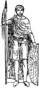
AËTIUS (Relief on ivory tablet found at Monza, in Northern Italy)

back to the bishop, crying, "A cloud! there is a cloud on the horizon as if made by an army marching!" "It is the aid of God," the bishop exclaimed. "It is the aid of God," repeated the people, and they fought with fresh courage. The cloud grew larger and larger. Now and then there was a flash of steel or the gleam of a war banner. The bishop was right; it was the brave Roman general Aëtius with his army, and Orleans was saved.