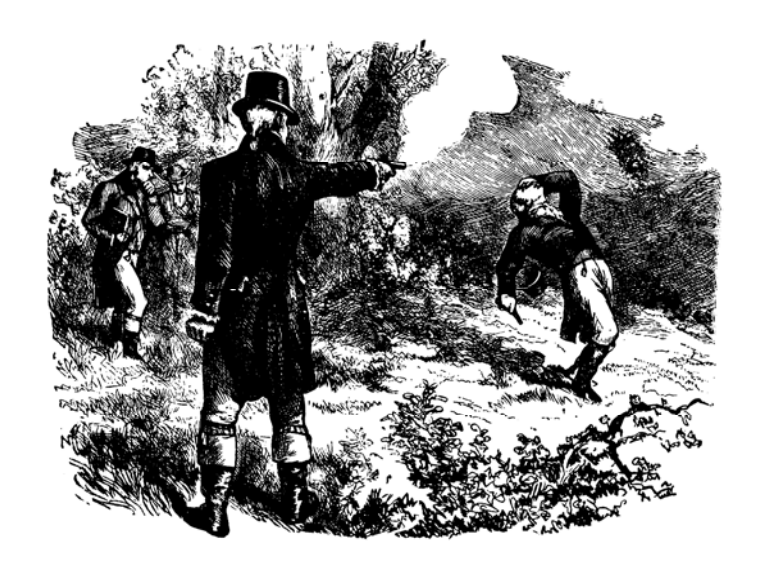
DUEL BETWEEN HAMILTON AND BURR

Finding himself now looked upon with such contempt and anger, he left the State, and for a long time wandered about through the western part of the country.