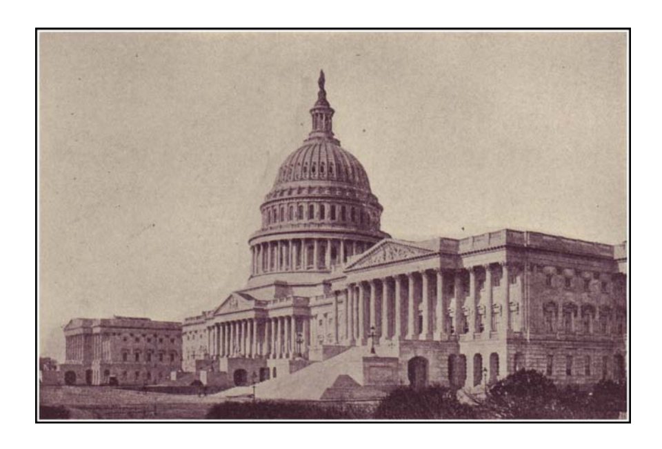
THE CAPITOL, WASHINGTON