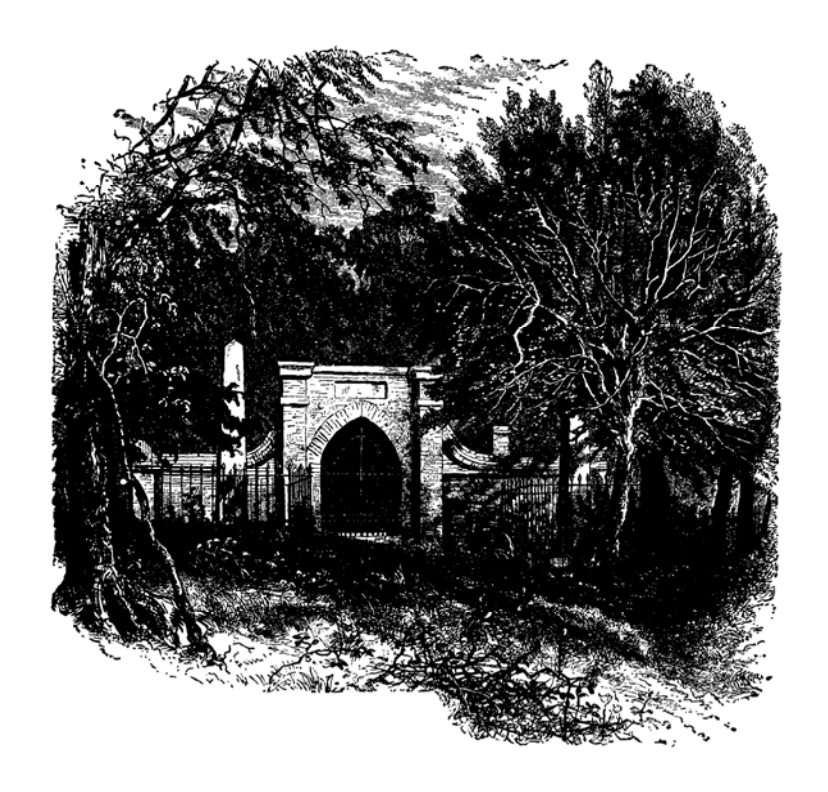
WASHINGTON'S GRAVE, MOUNT VERNON

Wherever Washington's name was mentioned, it was always with tender reverence and love.