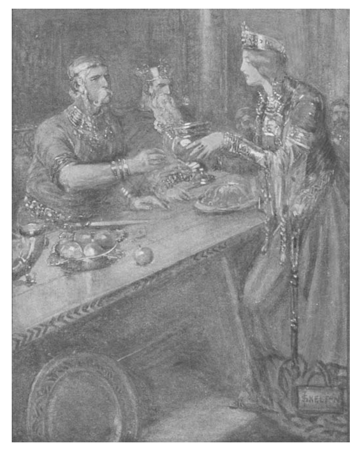
Giving to each warrior, young and old, wine from the golden cup

"I sware it when I did set out upon the deep sea, as I stood by my comrades upon the ship. I sware that I alone would do the deed or go down to death in the grip of the monster. As an earl I must fulfil my word, or here in the Hart Hall must I await my death-day."