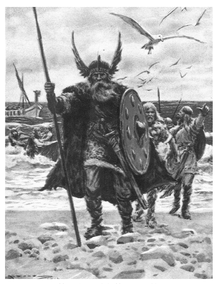
THE LANDING OF THE VIKINGS