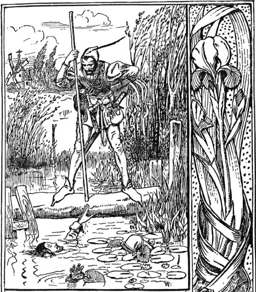
Robin Hood · meeteth · the · tall Stranger · on · the · Bridge