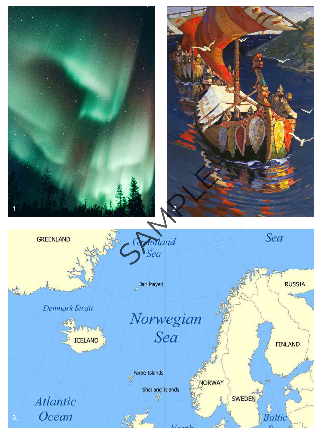
1. Aurora Borealis 2. Guests from Overseas by Nicholas Roerich, 1901, depicting a Viking Raid 3. The Norwegian Sea