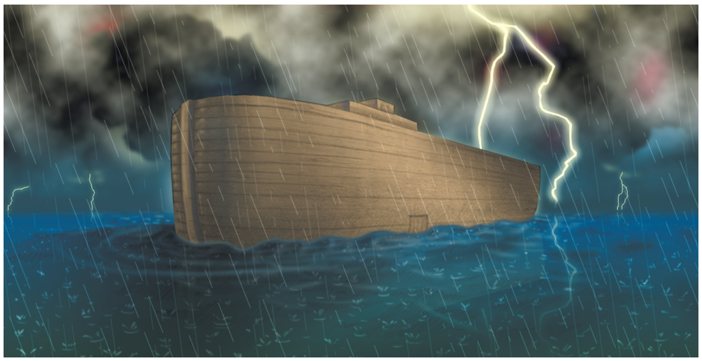
THE GREAT FLOOD OF NOAH'S TIME

Life on earth after the Flood was somewhat different from the way it was before the Flood. In this LIFEPAC® you will explore what the Bible says about life on earth before the Flood, during the Flood, and after the Flood. You will especially focus on the records of the Flood that God has provided, both in the Bible and in the physical parts of the earth.