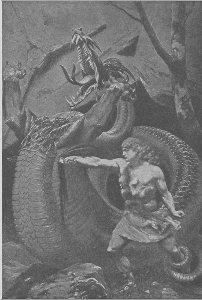
SIEGFRIED SLAYS THE DRAGON