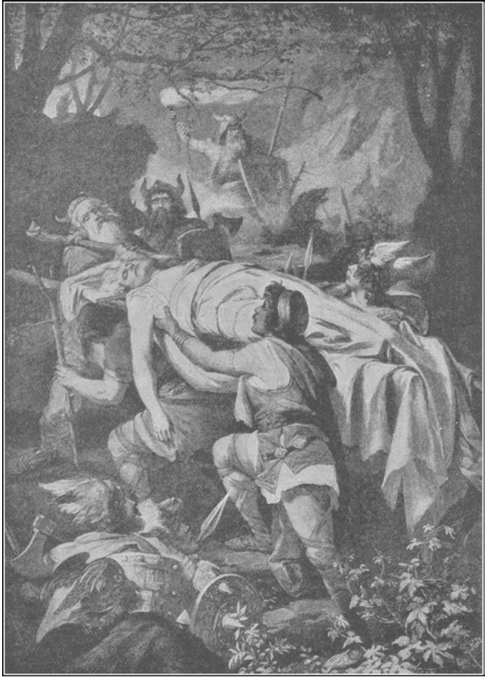
THE BODY OF SIEGFRIED IS CARRIED TO WORMS