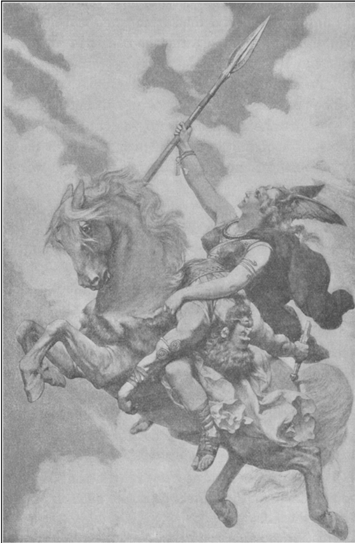
ONE OF THE VALKYRIES BEARING A HERO TO VALHALLA