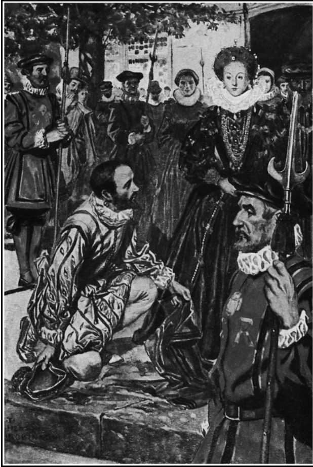
STEPPING GENTLY ON THE CLOAK, SHE PASSED ON.