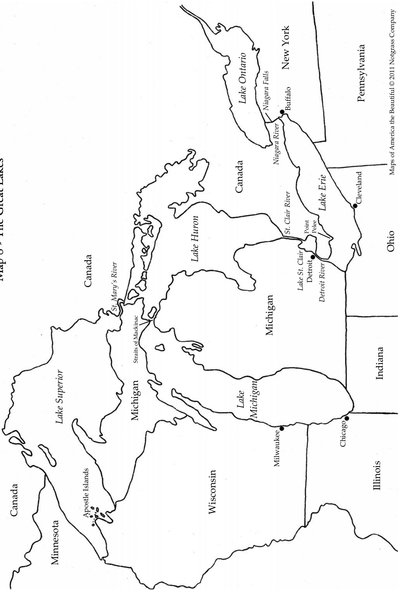
Map 8 - The Great Lakes