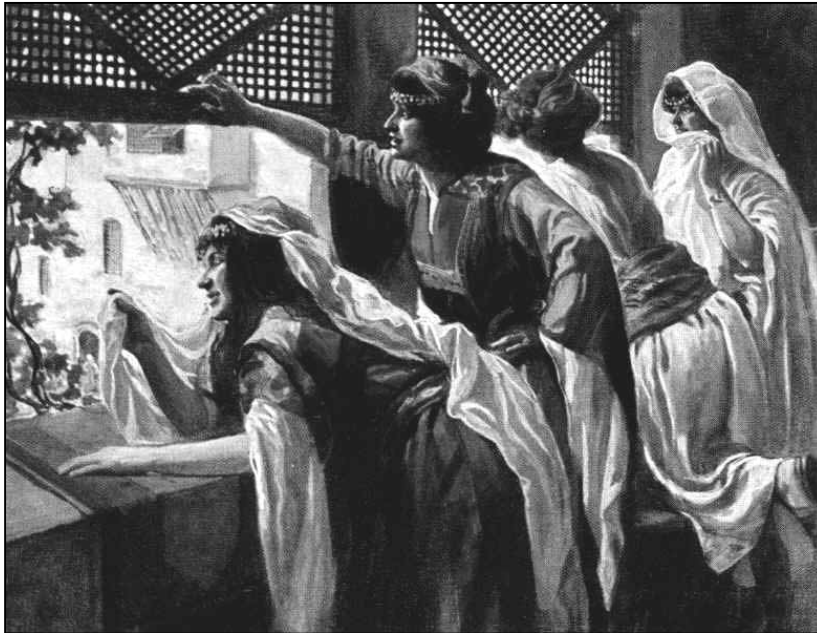
Michael despises David, painting by James Tissot.

David also gave alms to all the poor, and offered up costly sacrifices. His joy was marred, however, when his wife Michal despised him for dancing and singing before the