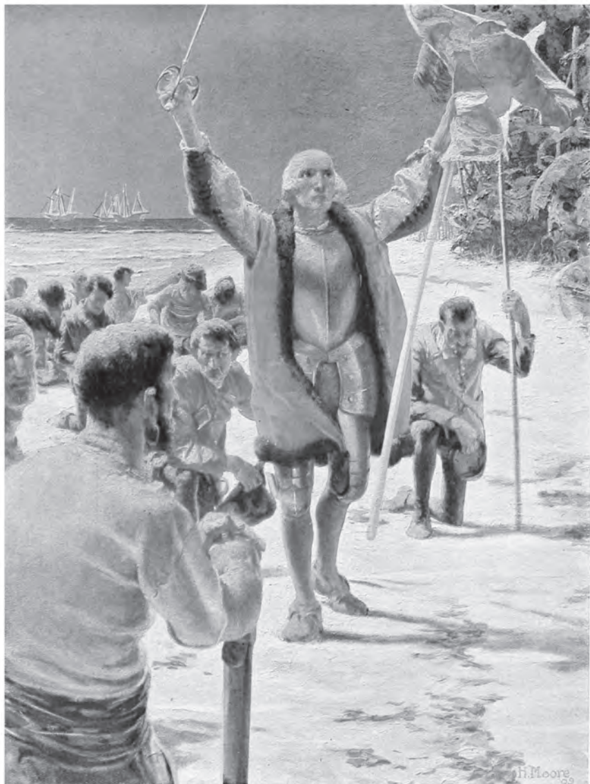
“COLUMBUS WAS DRESSED IN SHINING STEEL, WITH A BEAUTIFUL RED CLOAK, AND HE CARRIED THE RED AND YELLOW FLAG OF SPAIN.”