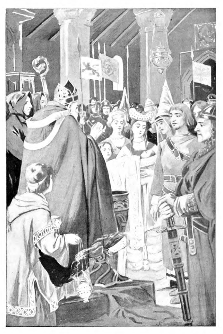
THE BAPTISM OF WILLIAM THE CONQUEROR