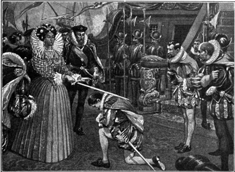
"I myself will make him a knight."

The story of the bold capture was carried to Panama and the other Spanish towns on the isthmus, but Drake was soon safe back on board of his ship. The fear of the bold sea rover spread to every port on the coast, and from that day the pride of Spain began to be humbled.