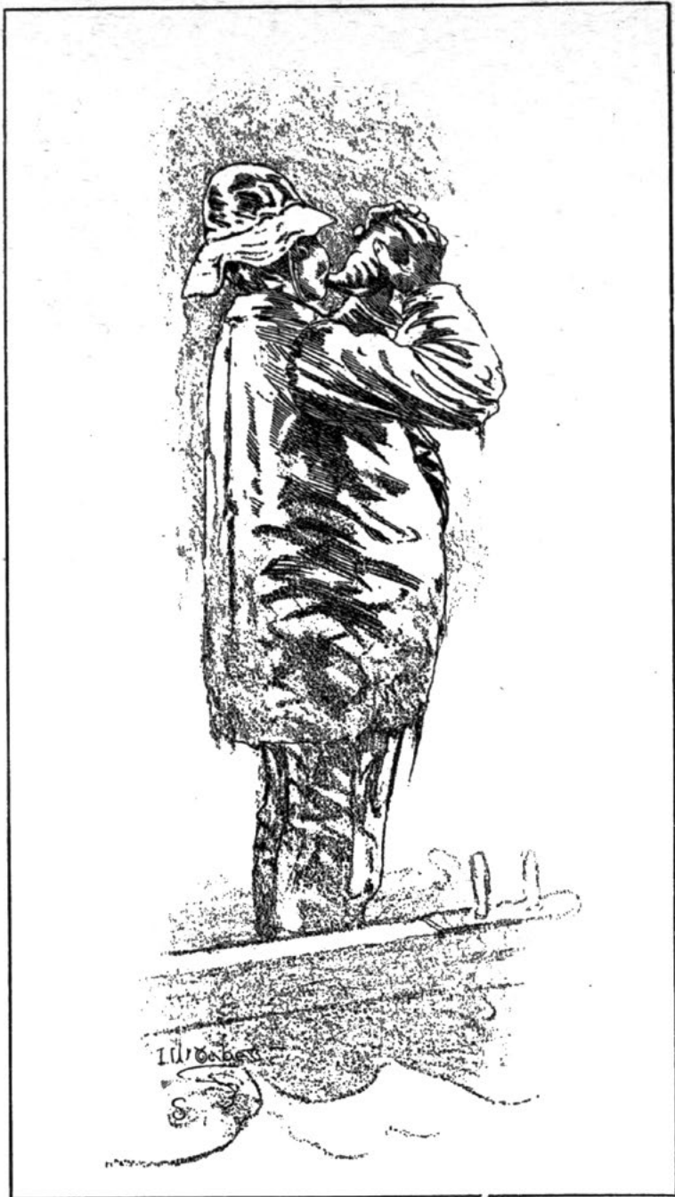
HE MUST NEEDS STAND UP TO IT, SWAYING WITH THE SWAY OF THE FLAT-BOTTOMED DORY, AND SEND A GRINDING, THUTTERING SHRIEK THROUGH THE FOG.