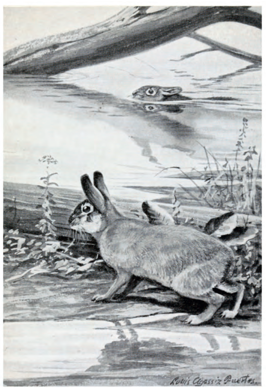
THE MARSH RABBIT. This cousin of Peter Rabbit is a famous swimmer.