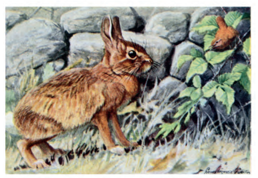
PETER RABBIT. The familiar Cottontail Rabbit whom everybody knows and loves.