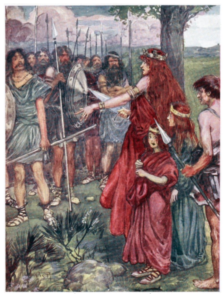
'WILL YOU FOLLOW ME, MEN?'