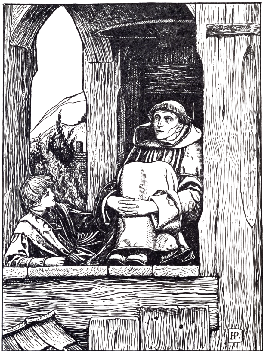
IN THE BELFRY.