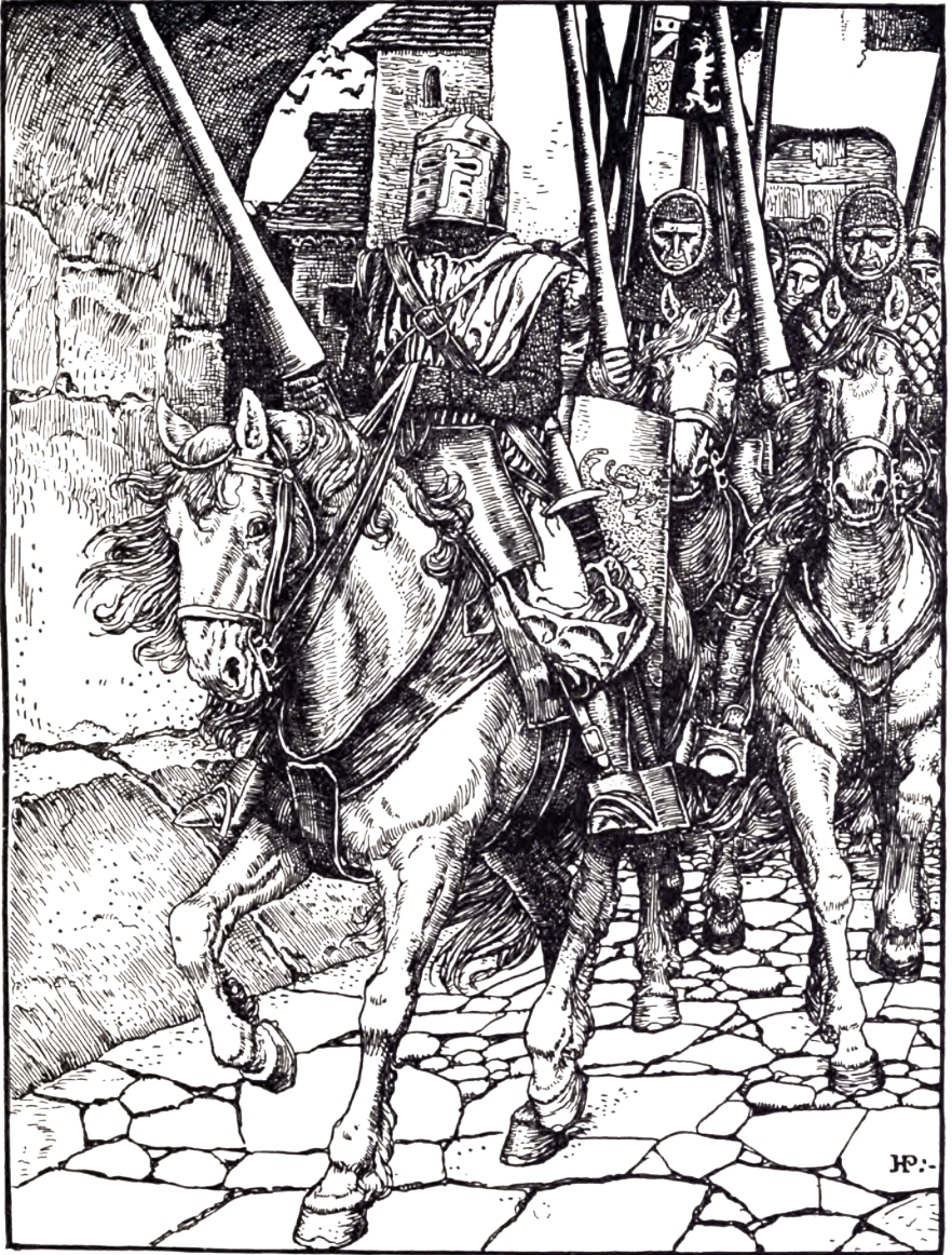
AWAY THEY RODE WITH CLASHING HOOFS AND RINGING ARMOUR.