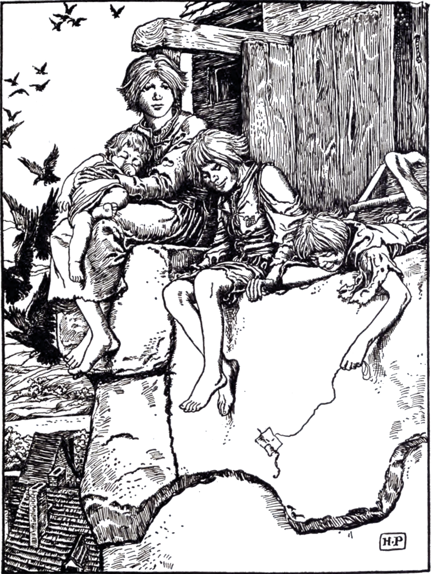
THERE THEY SAT, JUST AS LITTLE CHILDREN IN THE TOWN MIGHT SIT UPON THEIR FATHER'S DOOR-STEP.