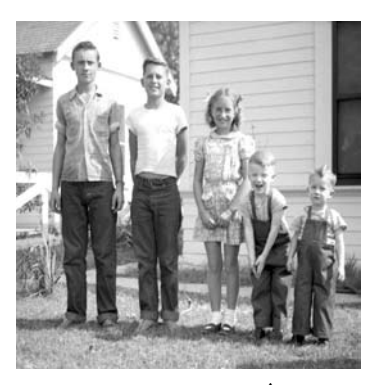
the author ↑ of Life of Fred

I haven't been able to stop laughing. Life is filled with too much joy.