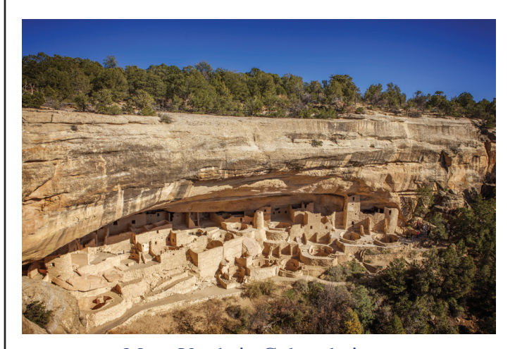
Mesa Verde in Colorado is an example of Pueblo architecture.

<sup>45</sup>The Northwest Coast tribes relied heavily on salmon, shellfish, berries, and camas root to provide their foods. 46Tribes were made up of villages built along the ocean shore or the edge of a bay or river. <sup>47</sup>Native homes along the coast were planked (long, flat timbers) longhouses. <sup>48</sup>They also used local forests to gather materials for woven mats, baskets, canoes, and other wood products. 49Inland from the coast, east of the Cascade Mountains, were the Plateau tribes. 50Like the Great Basin and Plains tribe, Plateau tribes were nomadic, moving with the seasons. 51Annual salmon runs up the Columbia River into the interior plateau region provided a major source of food. <sup>52</sup>Plateau tribes traded widely with the Northwest Coast tribes and the Plains tribes.