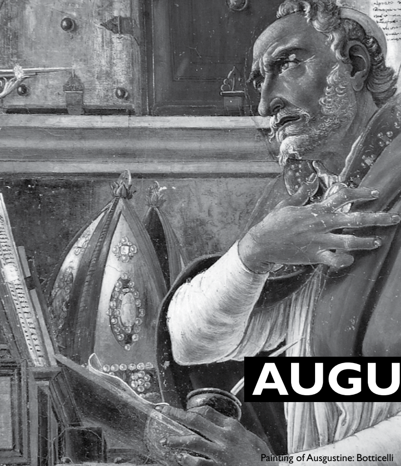
Painting of Augustus: Botticelli

One of the most influential thinkers of the Middle Ages, Augustine was a philosopher and teacher whose ideas bridged the gap between the classical age and the medieval age and had a significant impact on the theology of the church.