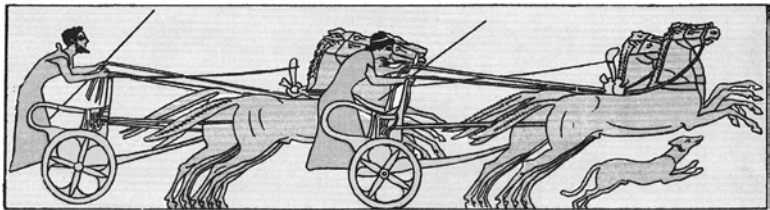
THE CHARIOT RACE

race of four-horse chariots. This same prize his half-brother Miltiades had also won. And in the next games at Olympia, being five years afterwards, he won again with the same mares; but granted to Pisistratus that his name should be proclaimed as the winner. Because he did this he came back to Athens under safe-conduct. And yet again he won the same prize with the same mares at the games next following; and having done this he was slain by the sons of Pisistratus, for Pisistratus himself was not yet alive. In the commonhall was he slain by men that were sent against him at night. He is buried before the City, beyond the road that is called the Hollow Road; and over against him are buried the mares that won for him these prizes. This same thing was done by other four mares, belonging to Evagoras the Lacedæmonian, but besides these none other have done it. This Cimon had two sons, of whom the elder, Stesagoras, was brought up by his friends in the Chersonese, and the younger, being named Miltiades, after this same uncle, was with his father in Athens.