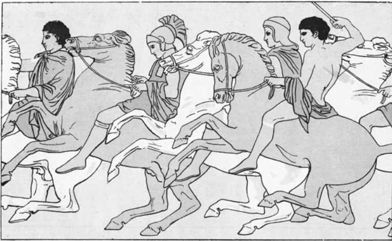
THE FESTIVAL OF ATHENE: HORSEMEN

The sons of Pisistratus sought to send their children out of the country secretly; but the children were taken. Then they made a covenant with the Athenians that, if the children should be given back to them, they would depart out of the country within the space of five days. And this they did, their house having had the lordship for thirty years and six. Thus was Athens rid of its lords.