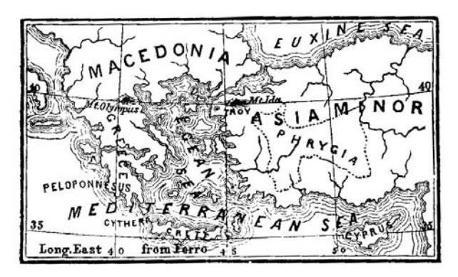
ORIGIN OF VENUS

felt in it was not the desire for ascertaining and communicating historic truth, but simply for entertaining companies of listeners with the details of a romantic story. The story, therefore, can not be relied upon as historically true; but it is no less important on that account, that all well-informed persons should know what it is.