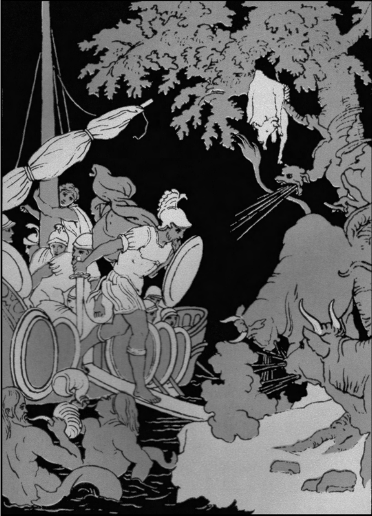
THE FIRE-BREATHING BULLS