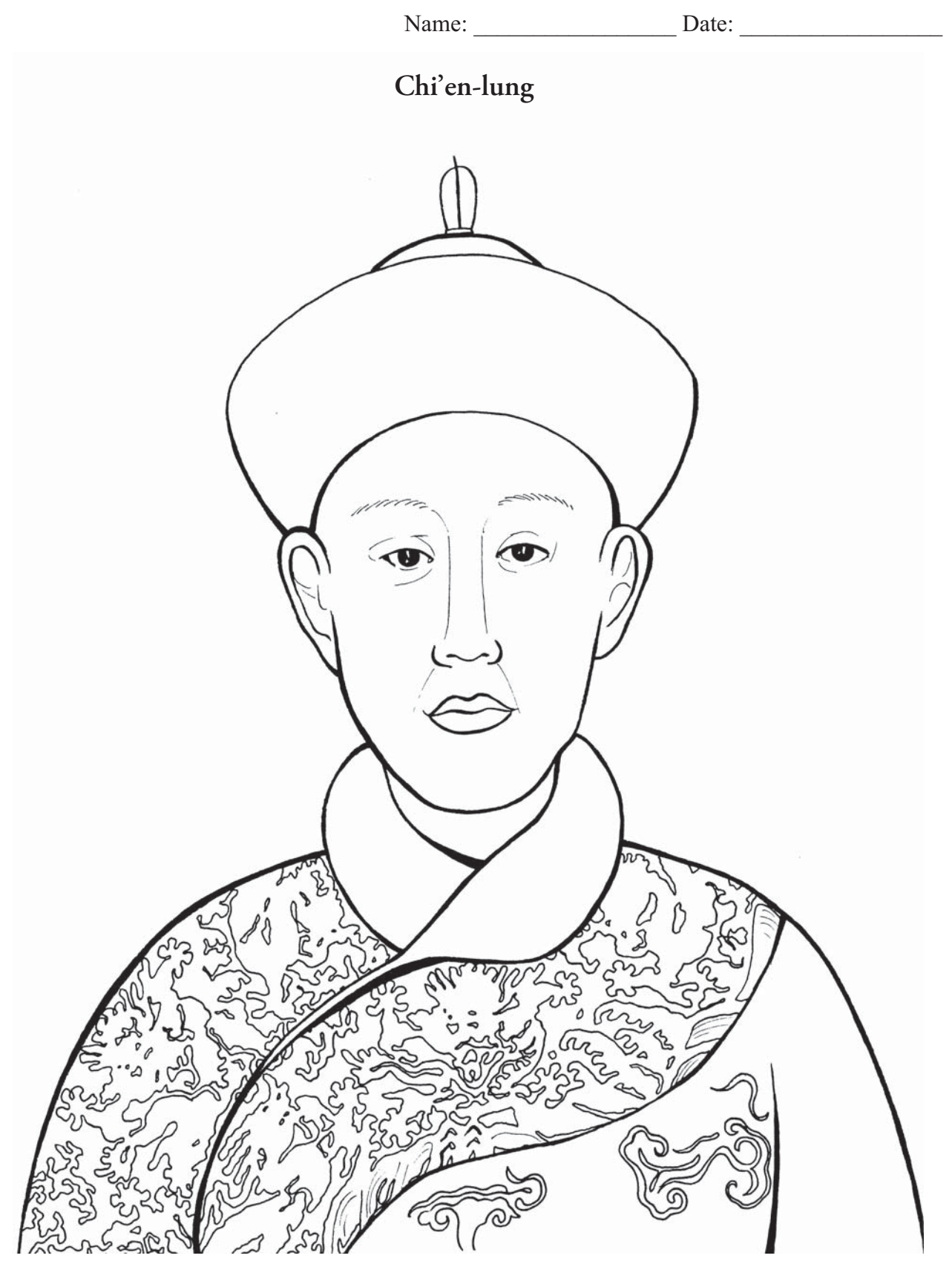
Chapter 20: The Imperial East