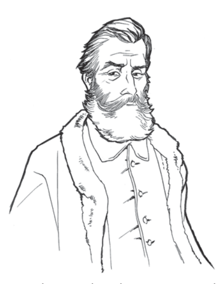
Merchant and explorer, Marco Polo

Marco Polo was amazed by the beautiful clothes that the Chinese people wore, by the abundance of fresh meat and vegetables in the Chinese markets, and by the size of the fruit. "Certain pears of enormous size," he wrote, "weigh as much as ten pounds each." And he was astounded to see fires made out of black rocks that burned. Marco Polo had never seen coal before!