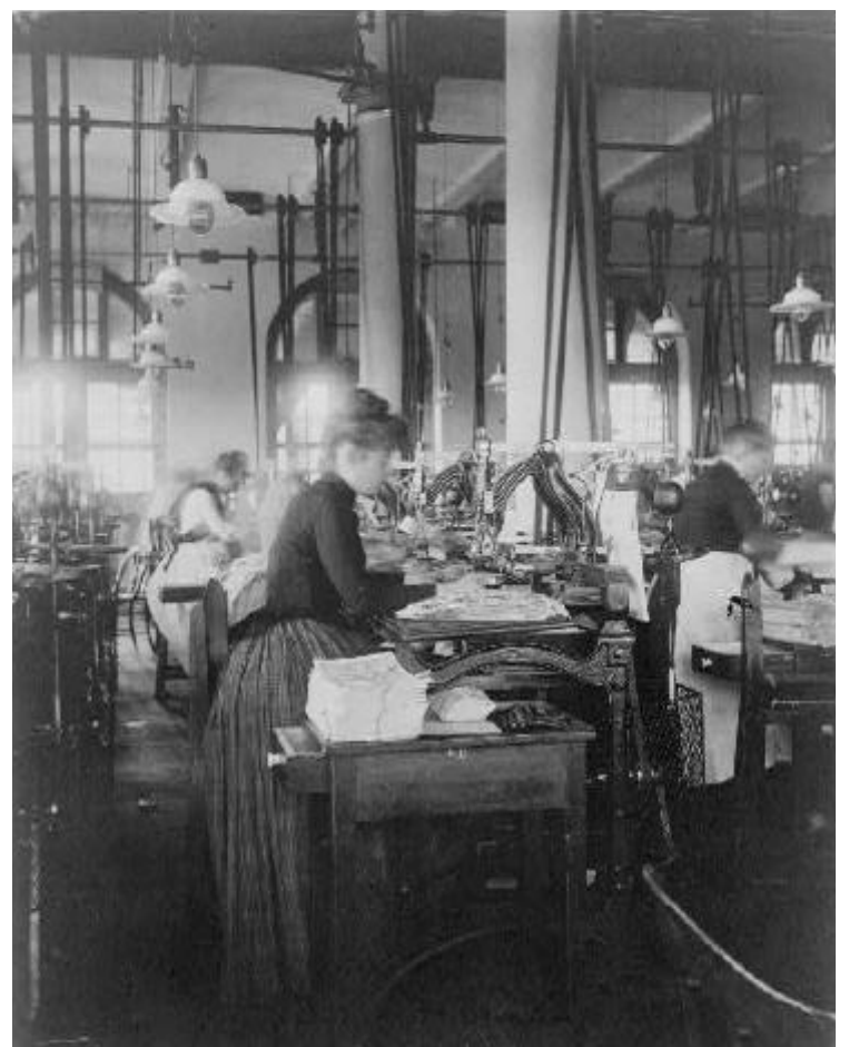
Workers Operating Machinery in the Bureau of Printing and Engraving, Washington, D.C., late 1800s

Sometimes states, counties, and cities offer tax breaks to big companies in an effort to attract them to a particular location. The county government might offer to waive the business property tax for ten years, for instance. In return for this, the county hopes that having the business or industry there will create jobs and generate revenue in other ways. Places that are competing for businesses to come can get into bidding wars to see how attractive they can make the package offered to a prospective business. Some large companies have been known to demand such concessions and tax abatements before they will consider building in a locality. Of course, smaller businesses and local property owners do not get offers of tax cuts. In fact, they have to pay more for the services that the big company uses. Some companies make payments in lieu of taxes, and the Federal government makes payments if a large amount of county land is owned by the Federal government (such as a military base) and thus cannot be taxed by the local authority.