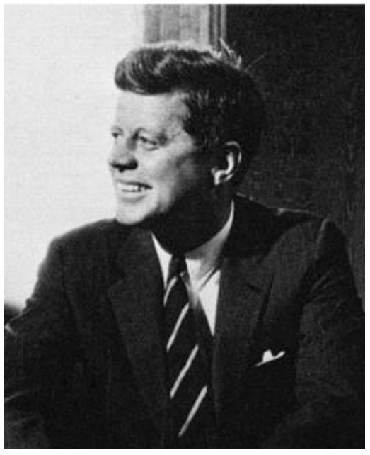
President John Kennedy

The answer to economic problems and personal difficulties is not always more government spending. Many times more government spending means more government bureaucrats but little help to those in need. What will help is less government spending, which enables people to save, invest, and spend more of their own money as they see fit.