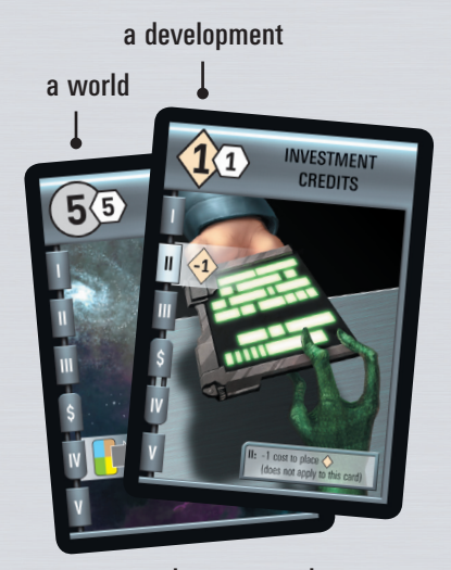
sample game cards (front)

Carefully remove the VP chips from their frame before your first game.