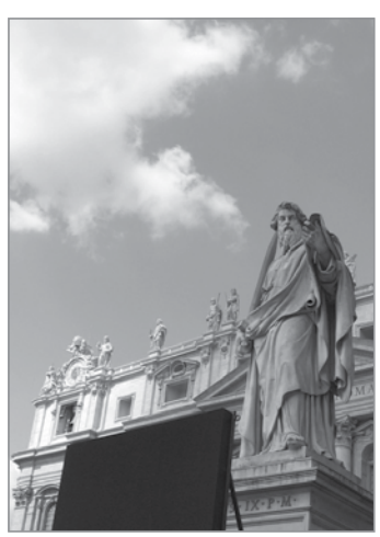
St. Peter's, Rome, Italy